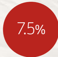
Reduced energy consumption in 32 out of 44 restaurants

A Mexican restaurant chain wanted to improve its energy use while reducing operational costs and environmental impact. Live energy data provided by our wireless sensors has saved enough energy to power 3.6 restaurants for a month.