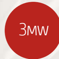
Energy storage capacity – enough to power 3,000 homes for 60 minutes

Gateshead Council wanted more flexibility over how they manage their energy. We supplemented combined heat and power (CHP) units with the UK’s largest commercial battery storage scheme to deliver energy to the local area and store it to cope with spikes in local demand.