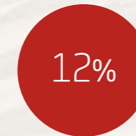
Energy savings per annum

Alton Towers Resort is one of the largest theme parks in Europe. They wanted a long-term energy strategy for reducing their energy use, utility cost and carbon footprint. Installing a CHP unit on site achieved 80% energy efficiency. Providing them with an innovative end-to-end solution, from manufacturing and installing to servicing, they felt de-risked.